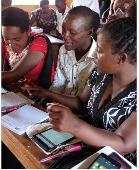
EduQuality Teacher Mentor Training, Uganda